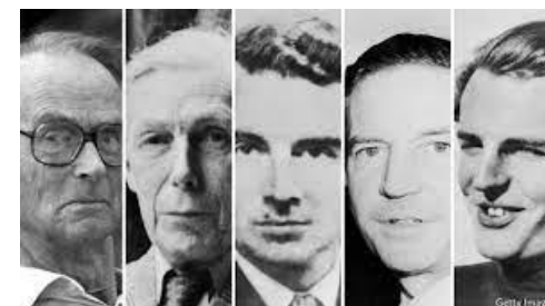
The Cambridge 5